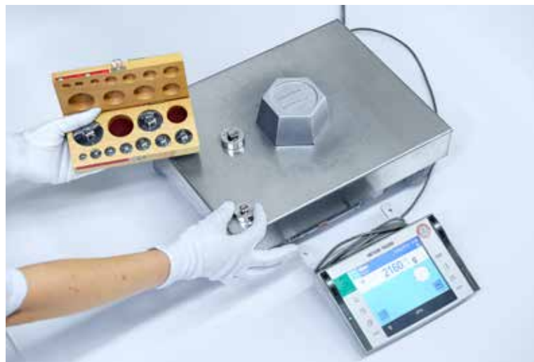
Calibration of the used balances

With the manometric method, the pressure increases in the cylinder during and after the addition of each mixture component is measured. The advantage of this method is the high level of flexibility; the disadvantage is the systematically low process accuracy.