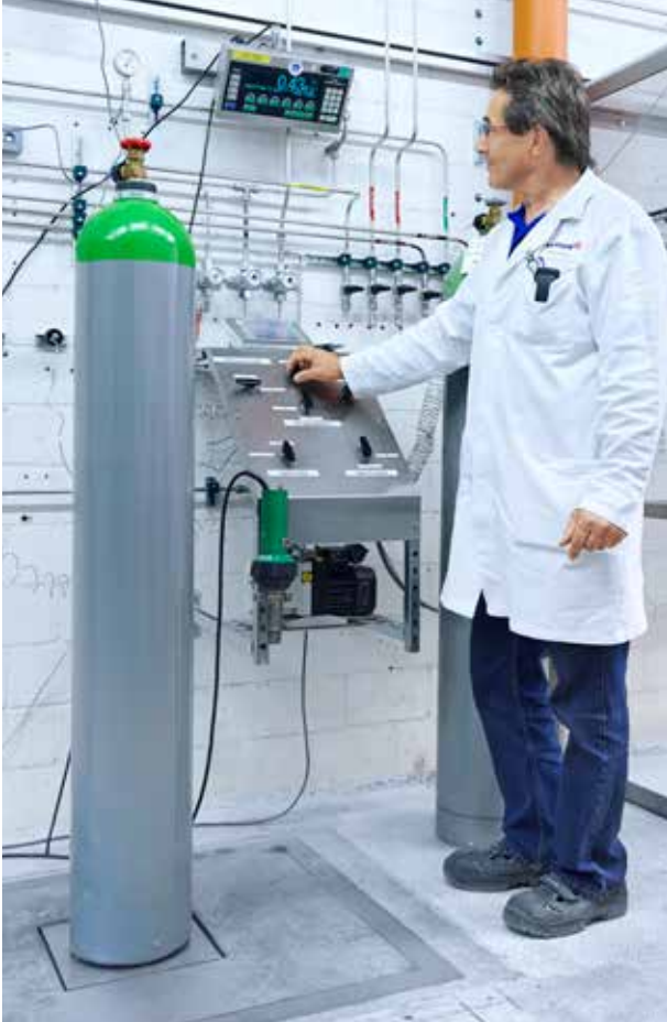
Gravimetric production of gas mixtures in Lenzburg

The most common procedure for manufacturing of high precision calibration gas mixtures is the gravimetric method according to ISO 6142 (Gas analysis - Preparation of calibration gas mixtures - Gravimetric method). This method is based on weighing the masses of the particular components. Weighing is one of the most accurate physical measuring methods, which is why the gravimetric preparation is employed to manufacture high precision calibration gas mixtures.