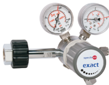
Line pressure regulator LM51