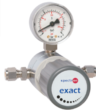
Cylinder regulator FM 52 exact